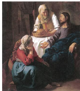
Christ in the House of Martha and Mary