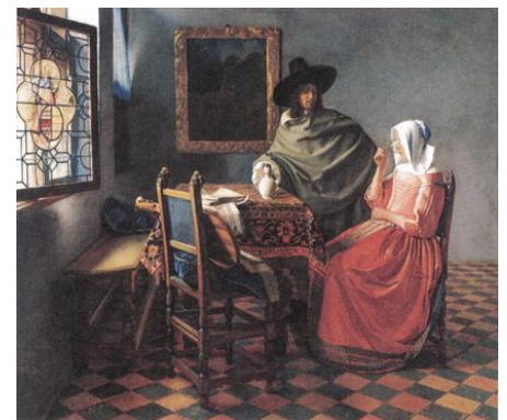
The Wine Glass