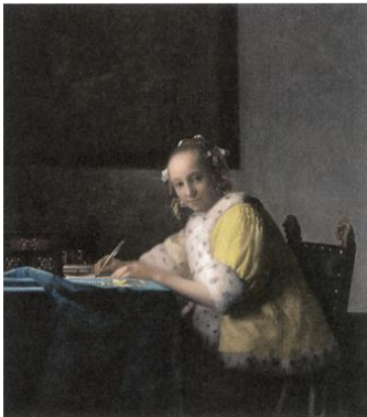
A Lady Writing

With 7 paintings of Vermeer exhibited, this exhibition achieved a record number of visitors of 930,000. This exhibition in October will exceed record with 8 paintings, including works which are yet to be exhibited here in Japan.