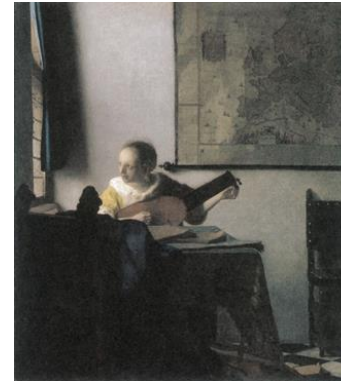
The Woman with a Lute