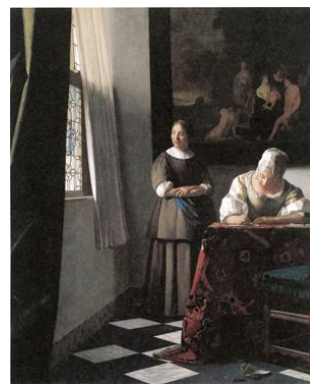
Woman Writing a Letter, with her Maid