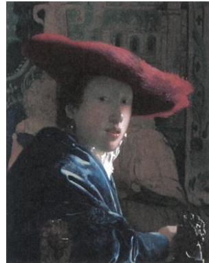
Girl with the Red Hat