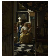
The Love Letter

The Procuress , a collection from the Gemäldegalerie Alte Meister in Dresden, Germany, is the first time to be shown in Japan. This is one of Vermeer’s early works as well as the first genre picture of Vermeer, who had worked on religious and story pictures. Among the existing works of Vermeer, only 3 works indicate the year made, and this is the one that includes the exact year made and his signature on the right bottom of the painting.