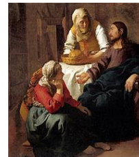
Christ in the House of Martha and Mary