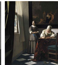
Lady Writing a Letter with her Maid