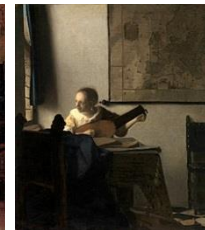
Woman with a Lute